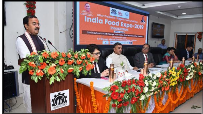
Hon'ble Deputy CM of UP Shri Keshav Prashad Maurya addressing the audience

In his inaugural address Hon'ble Deputy CM said that अब वह समय चला गया है जब उद्यमी को अपना उद्योग चलाने में डर लगता था। हमारी सरकार में आप निडर होकर काम करें। उद्योगों को बहुत सारी समस्याएँ आती हैं परन्तु ऐसी कोई समस्या नहीं है जिसका समाधान सरकार के पास नहीं है। खाद्य प्रसंस्करण उद्योगों को प्रदेश में स्थापित करने के लिए सरकार ने एक अच्छी पालिसी बनायीं है जिसके बाद आज तक प्रदेश में ३३० नई खाद्य प्रसंस्करण इकाईयाँ स्थापित हो चुकी हैं परन्तु देश में सबसे बड़ा राज्य होने के नाते हम इस आंकड़े से संतुष्ट नहीं हैं हमें इसे हजारों और लाखों में ले जाना है। प्रदेश से जो पहले उद्यमियों का पलायन होता था वह अब नहीं होगा हमने ऐसी परिस्थितियाँ सृजित कर दी हैं।