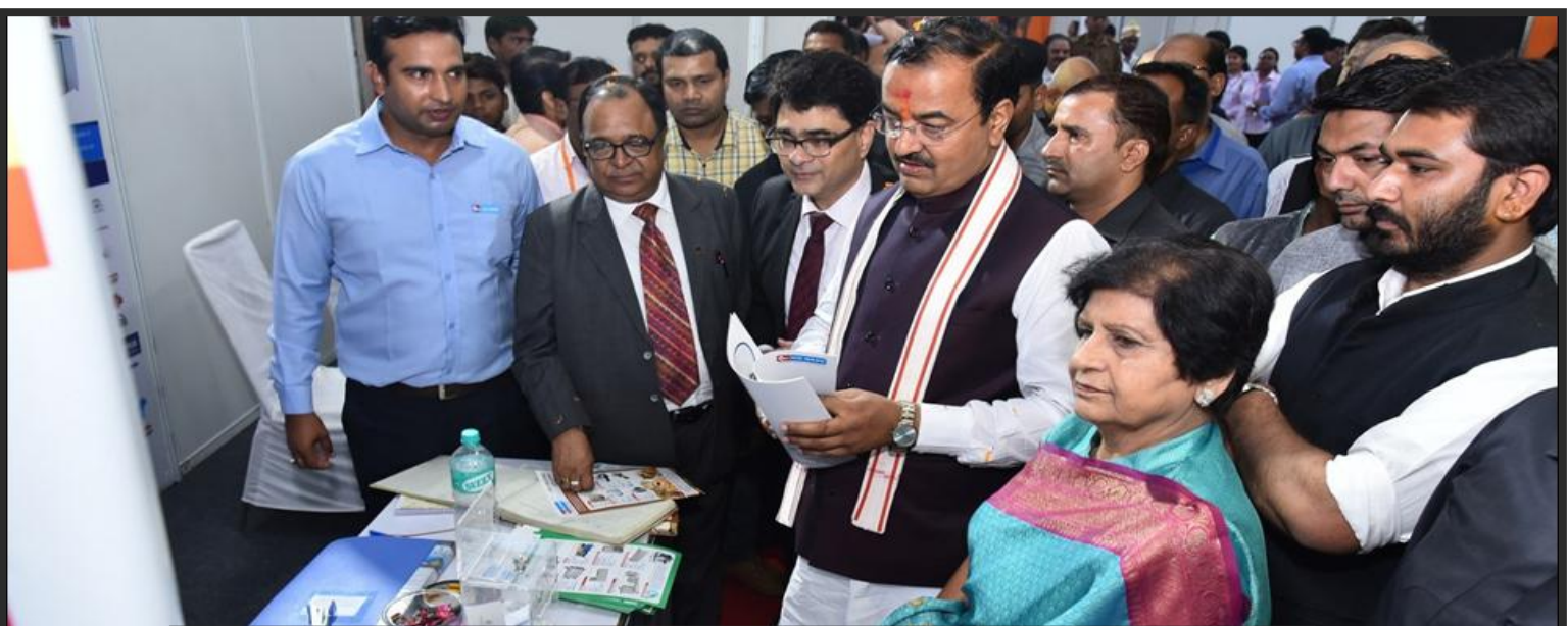
Hon'ble Deputy CM of UP Shri Keshav Prashad Maurya along with other delegates from Government and IIA visited the Stalls during Inauguration fo India Food Expo-2019 at Lucknow on 8th Nov 2019.

A long with all dignitaries Chief Guest visited the stalls displaying Food Processing Machinery, Agro & Food Processing Technologies, Agri & Food Processing Products developed by Research Institutions, Food Product testing facilities, Innovative Food Products, Consumer Food Products & Food Processing Industries Policies & Schemes.