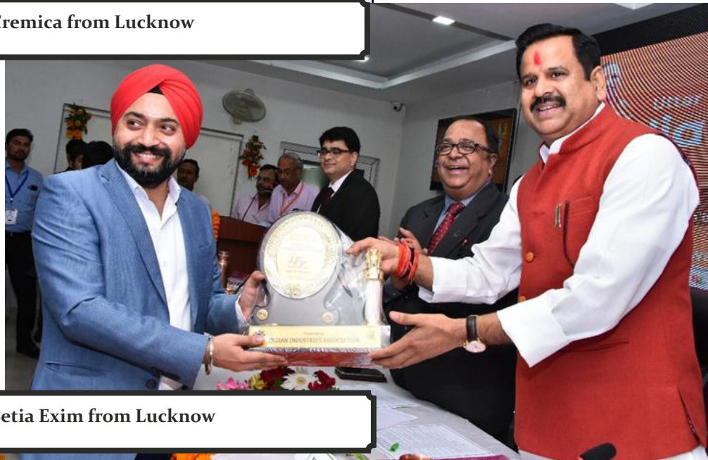
Consolation Prize to M/s Setia Exim from Lucknow