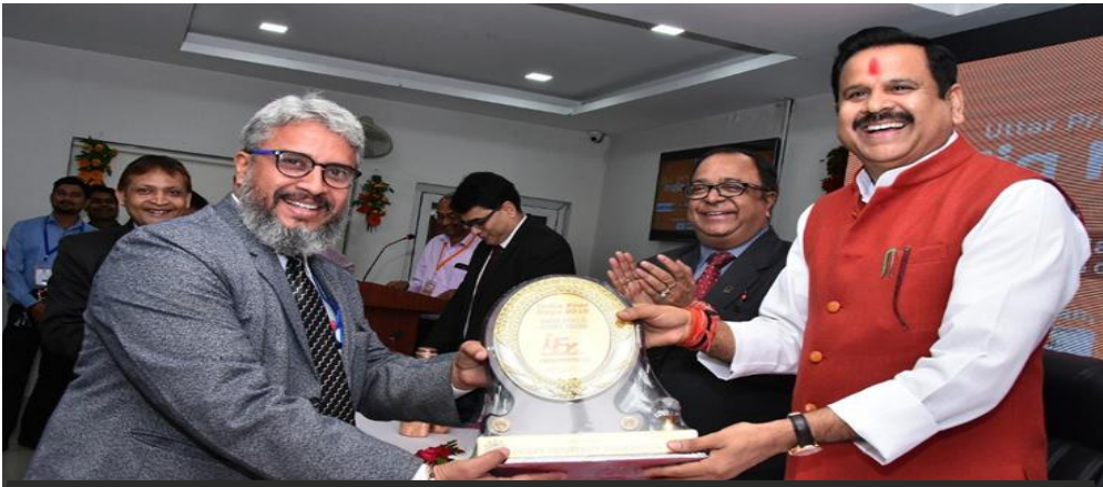
1 st Prize bagged by M/s Pritul Machines from Muzaffarnagar

In the closing ceremony of India Food Expo 2019, the 1st prize for the best stall was bagged by Pritul Machine, Muzaffarnagar, the 2nd prize went to RLRC, Bareilly and the 3rd Prize to Cremica, Lucknow. Consolation prize for the best stall was given to Setai Exim.