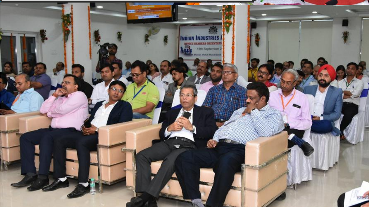
Audience Gathered for Closing Ceremony of India Food Expo-2019 at IIA Bhawan, Lucknow