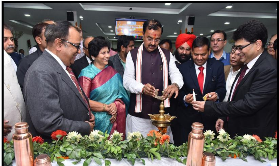
Lighting of Lamp by Hon'ble Deputy CM of UP Shri Keshav Prashad Maurya during Inauguration of India Food Expo-2019 at Lucknow

Smt. Sanyukta Bhatia, Mayor of Lucknow presided over the inauguration ceremony.