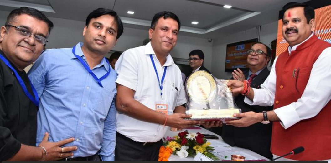
3 rd Prize bagged by M/s Cremica from Lucknow